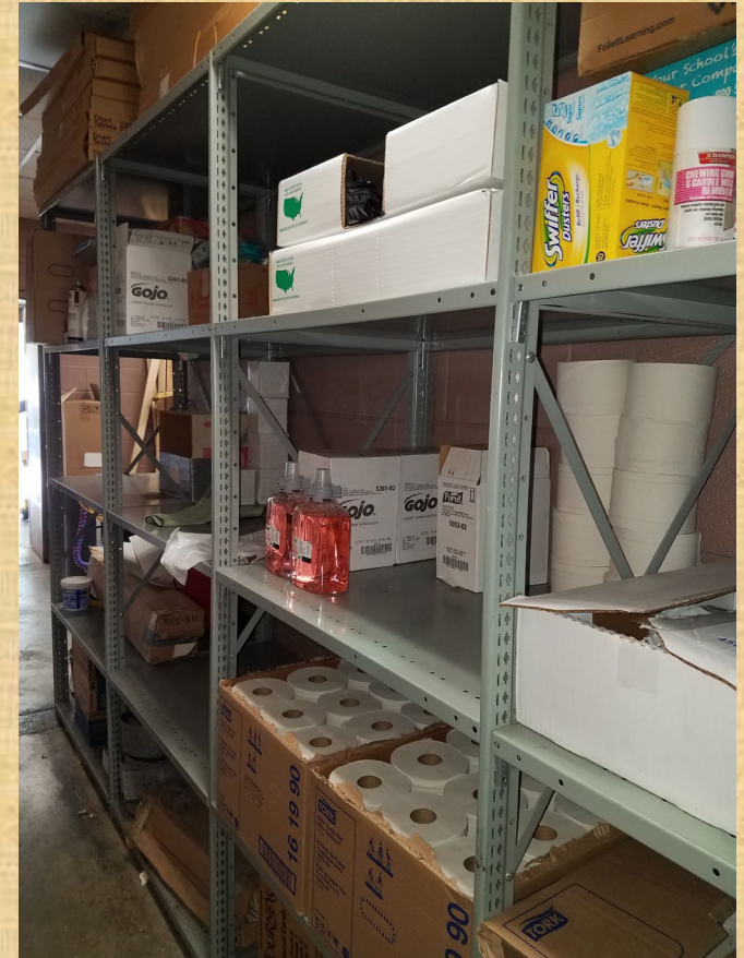
Supply closet organization