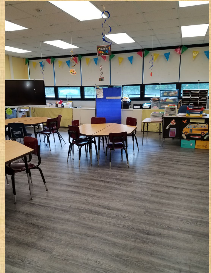
New classroom floor installation