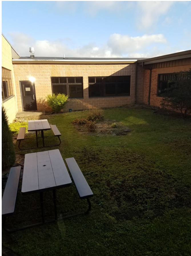
East courtyard cleanup