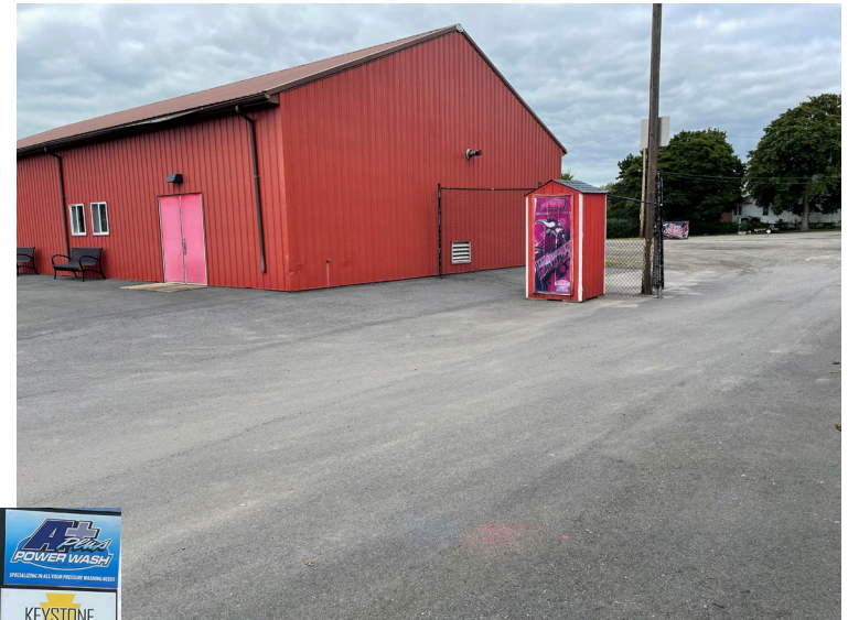
Removal of turf at field entrance