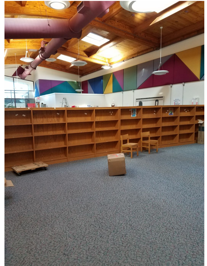
Library organization project