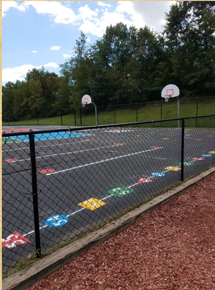
Repaired playground fence