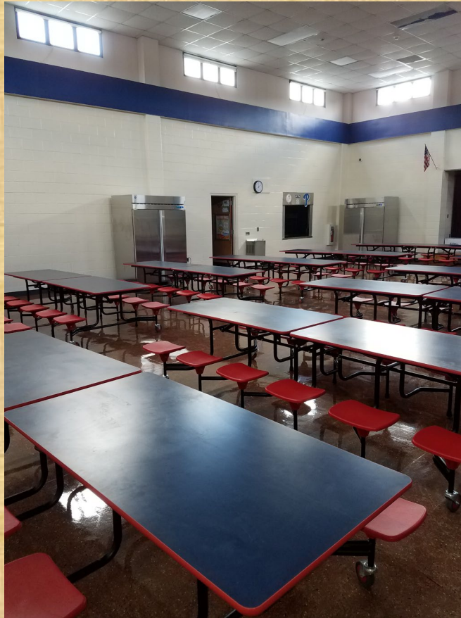
Multipurpose painting/new tables