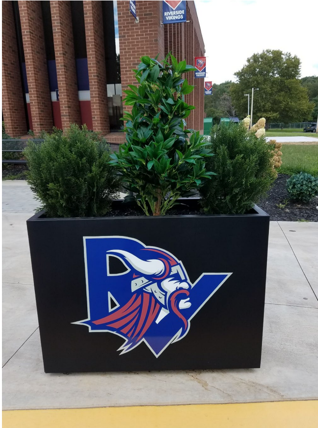
New faux greenery for planters