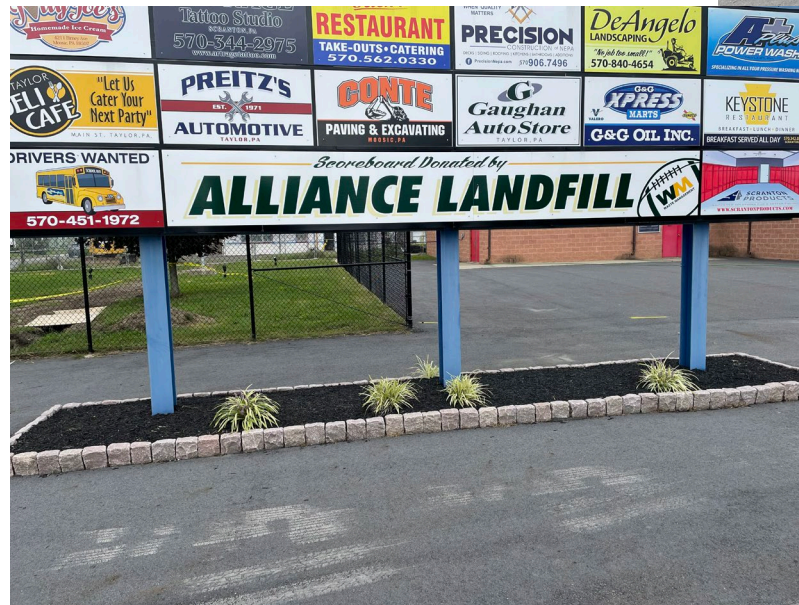
Bed mulching under scoreboard